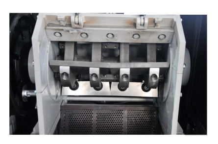
The cutting chamber sits in a soundproofed enclosure to ensure quiet inline operation. The rotor and screen area are easily accessible for cleaning and maintenance without the need for additional tools.

The tangential cutting chamber paired with the aggressive open rotor design ensures reliable ingestion of voluminous parts. The curved cutting chamber backwall reduces the risk of parts getting stuck.